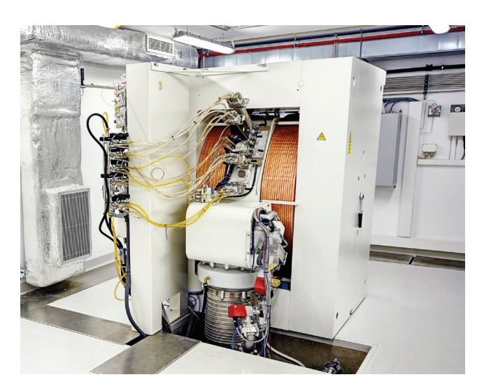
Figure 3. GE PETtrace p/d cyclotron