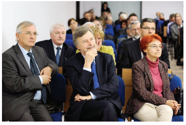
Figure 1. Opening ceremony guests

Besides the 100 micro-Amperes proton machine, the new Centre disposes of two adjacent laboratories equipped with hot cells, radiopharmaceutical synthesizers and dispensers. The first