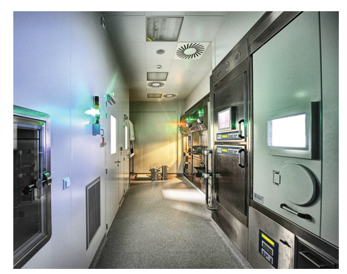
Figure 4. Hot cells in the Research Laboratory

On the evening of the following day a Get Together party for the participants of the Positron Emission Tomography in Research